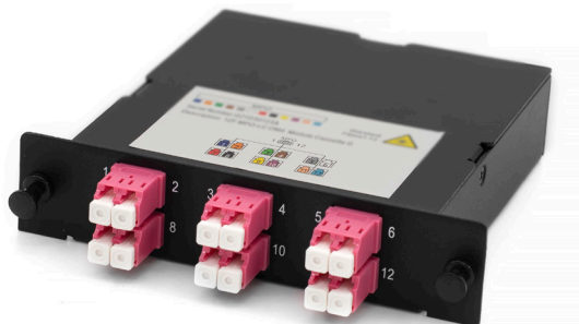
6 LC Quad Adapters, 12 Fiber MPO to OM4 (FOMPOLC12F-6D4)