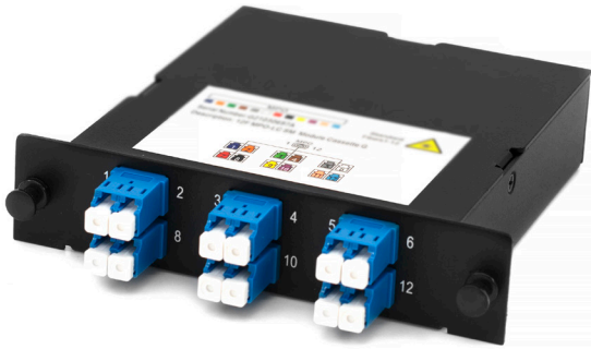
6 LC Quad Adapters, 12 Fiber MPO to SM (FOMPOLC12F-6D1)