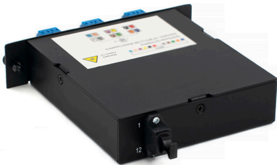
(Single Mode Rear View)