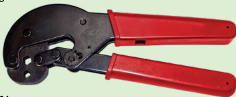
Item No. WTCXC-03634